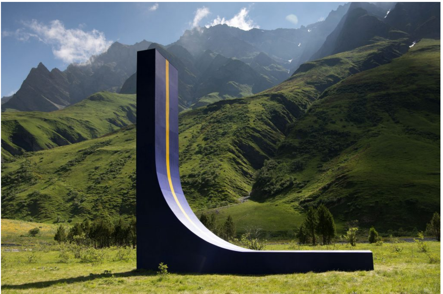
The Swiss-Austrian artist duo Bildstein | Glatz's Himmel III.

As if the magnificent rolling hills and outstanding views of a bucolic wonderland weren't enough, now, visitors to the Safien Valley in the Swiss Alps have even more reason to be excited, with the opening of a unique art exhibition that sees installations inspired by nature set in place across the area.