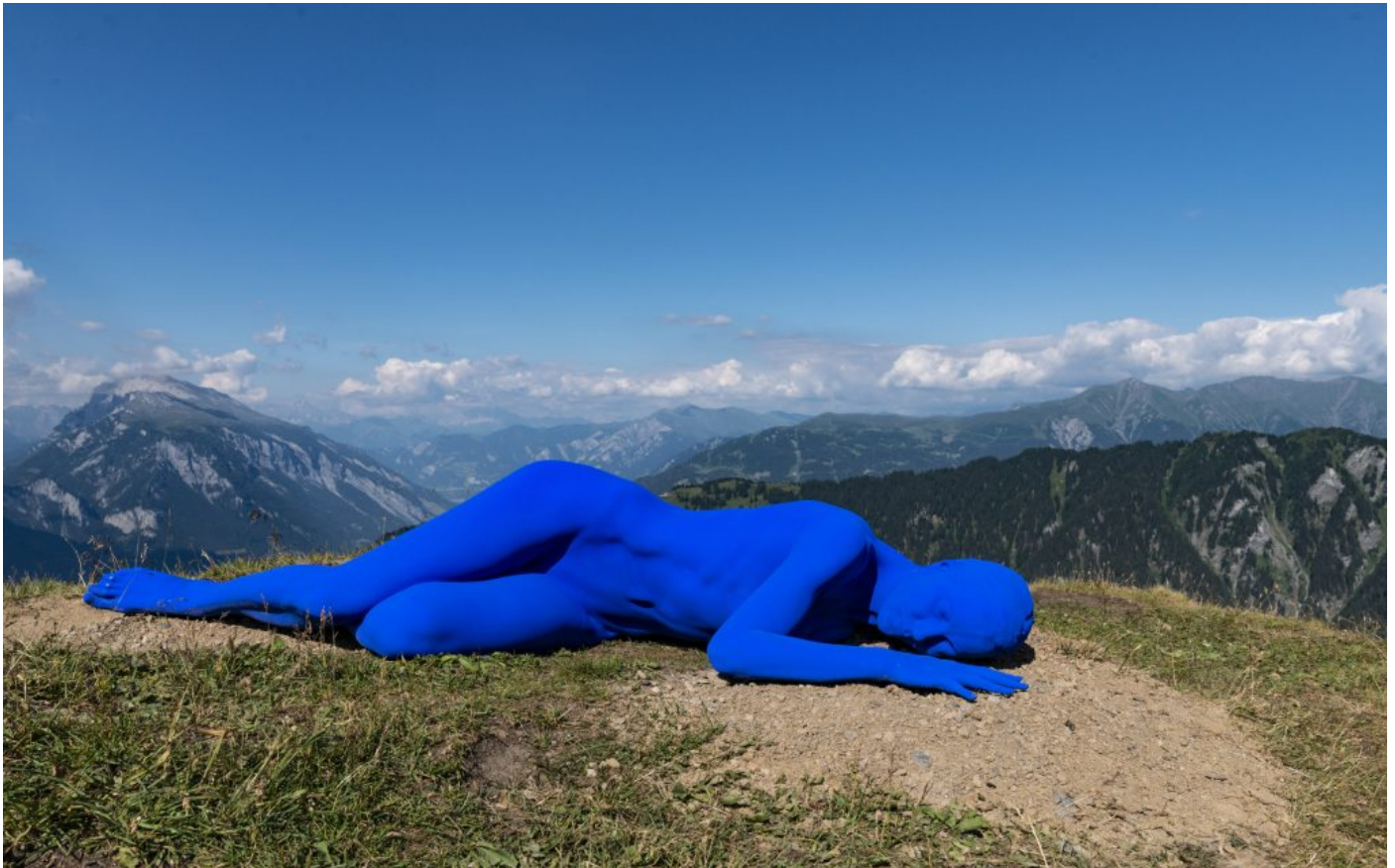
Lita Albuquerque's "Transparent Earth" installation.

racing stripe, designed to cast the eyes of viewers upwards towards the mountains , a hive of honey bees whose buzzing sounds are broadcast through speakers, a camera obscura inside a traditional stable that projects an upside-down picture of the Alps into the room, and a video installation in an underground tunnel.